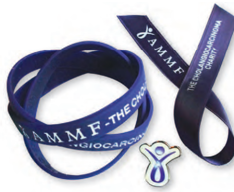
Wristbands, ribbons and pins

* Look out for our new, bespoke vests, t-shirts and cycle tops, coming in Spring 2015!