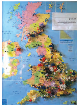
GP practices approached as at February 2015

One of the major difficulties with cholangiocarcinoma is the lack of awareness at primary care level of its insidious and, admittedly, often vague and non-specific symptoms which can lead to late diagnosis. During Awareness Month, February 2014, AMMF launched a GP Awareness Campaign to address this problem, and the campaign has been ongoing since.